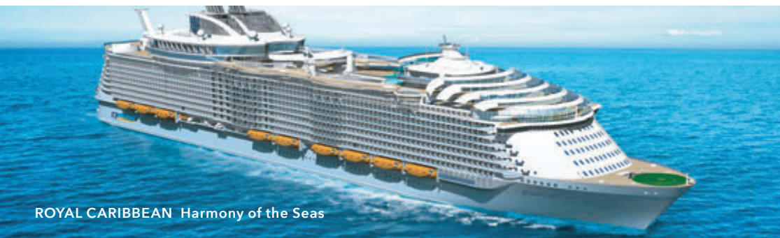
ROYAL CARIBBEAN Harmony of the Seas

Being removed from day-to-day distractions, learning how to succeed in real estate, creating and focusing on your goals, and making great connections while enjoying some of the most spectacular scenery in the world, is what the AORE Annual SmART Summit is all about.